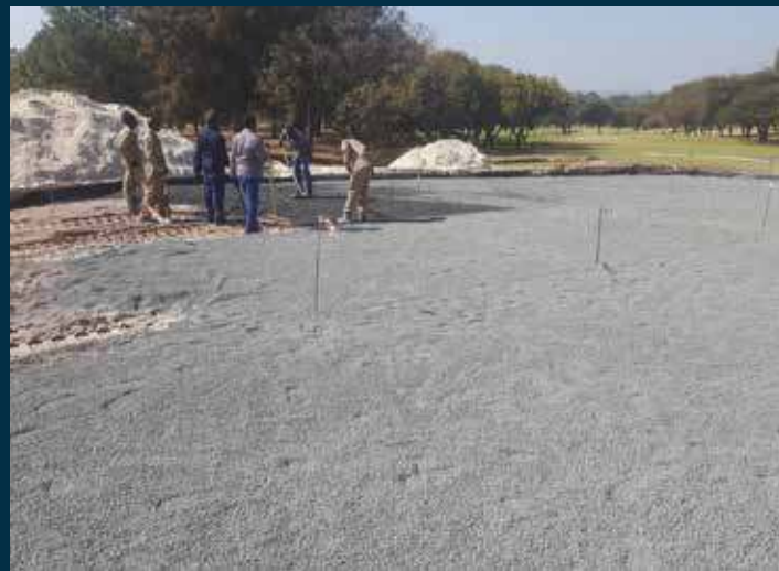
Hole 1 - before

Here are a couple of pictures of the recent greens resurfacing project. A detailed construction file can be viewed at the General Manager's office.