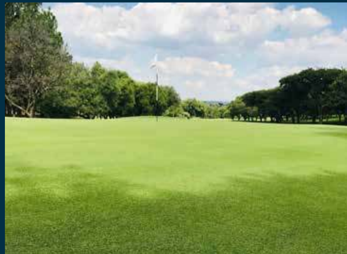
Hole 1 - after