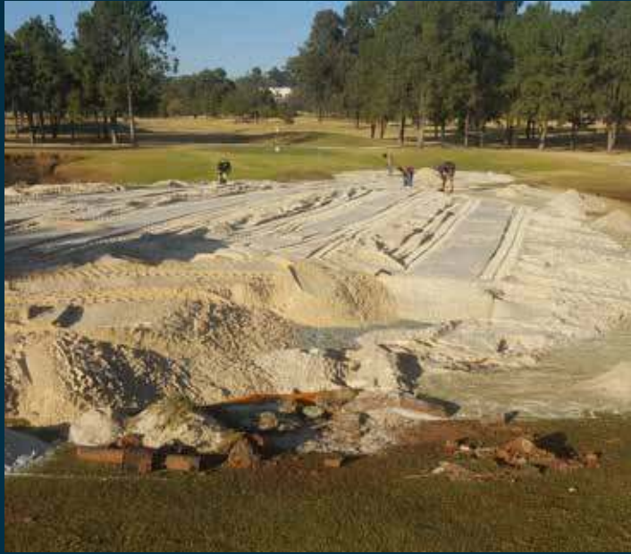
Hole 7 - before