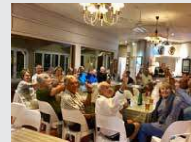
Another get-together after our floodlit evening bowls - supper and wine is served.