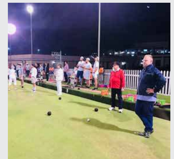
Young Members' Barefoot Bowls event.