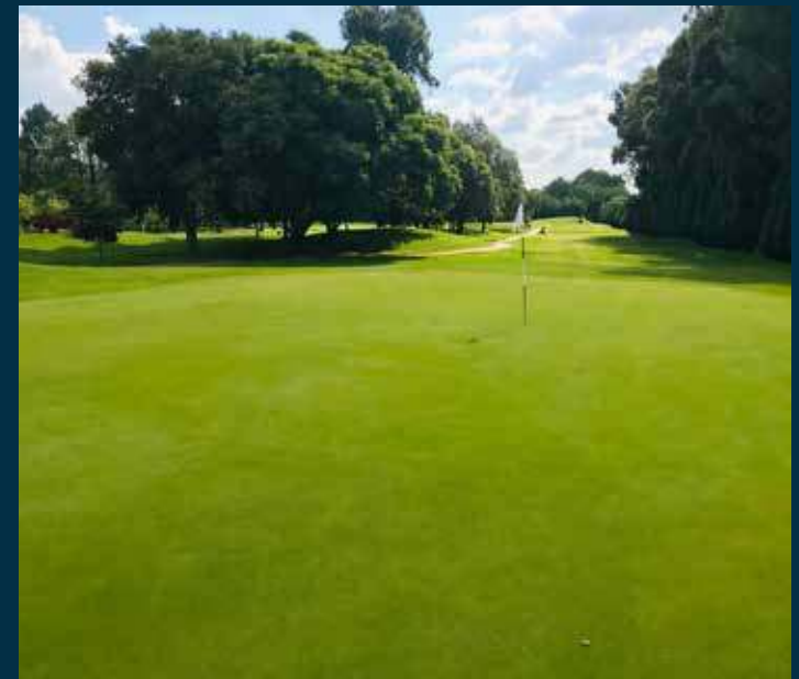
Hole 5 - after