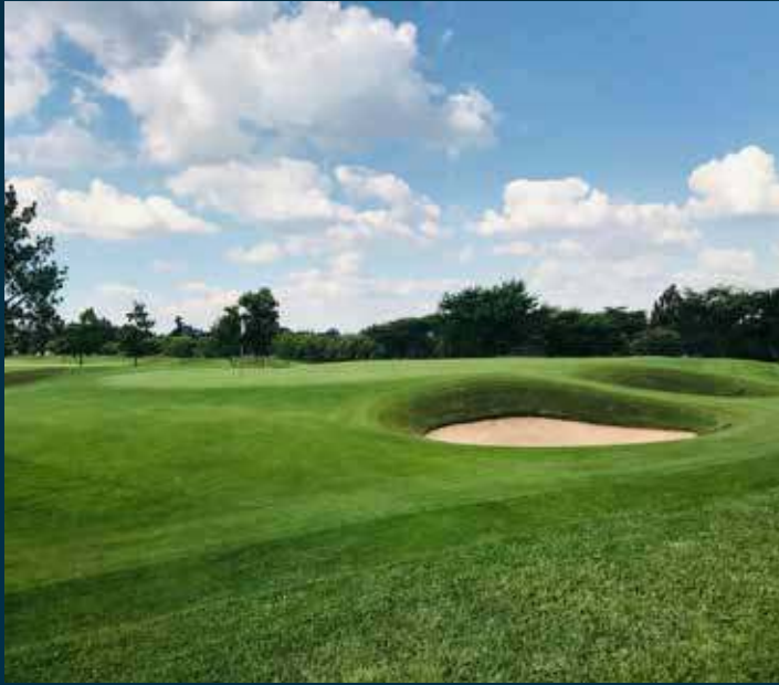
Hole 10 - after