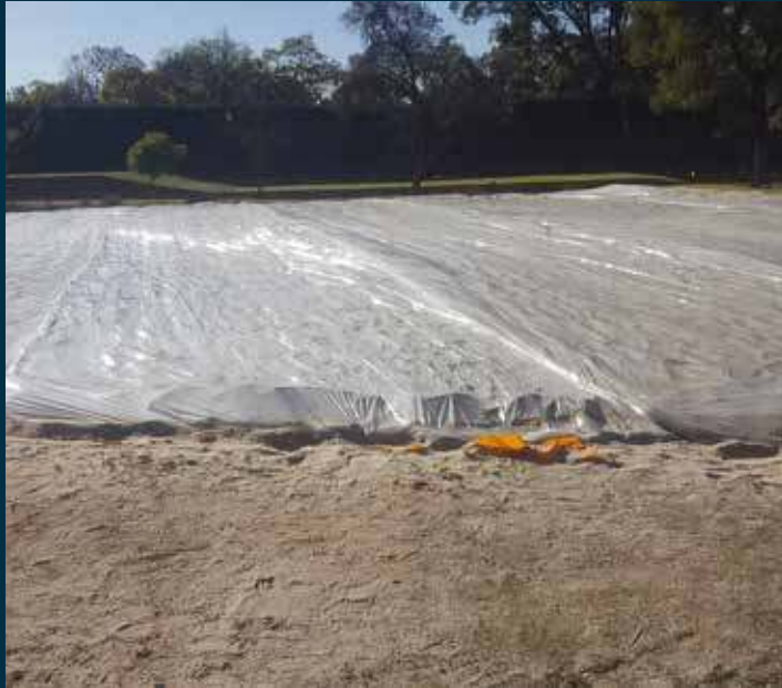
Hole 8 - before