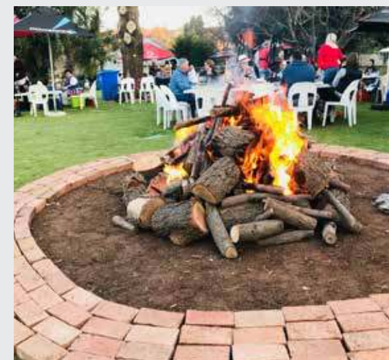
The ever-popular yearly Ring of Fire braai in front of the Grand Lounge.