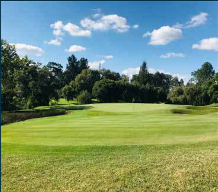
Hole 16 - after