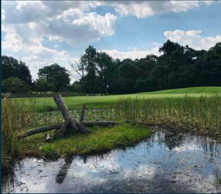
Hole 7 - after