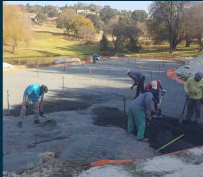
Hole 14 - before