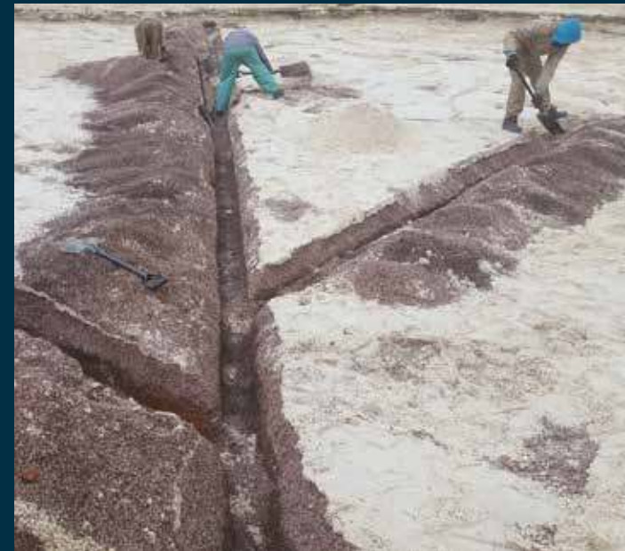
Hole 4 - before