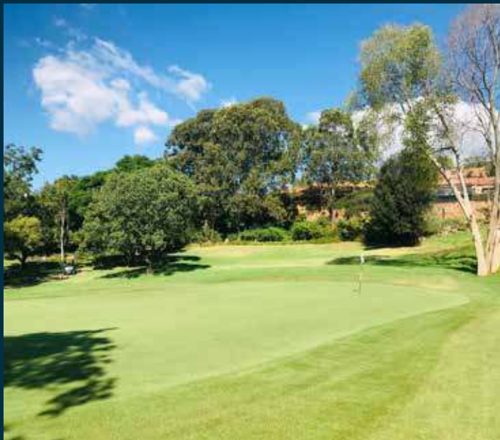
Hole 15 - after