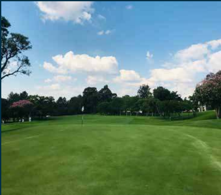
Hole 13 - after