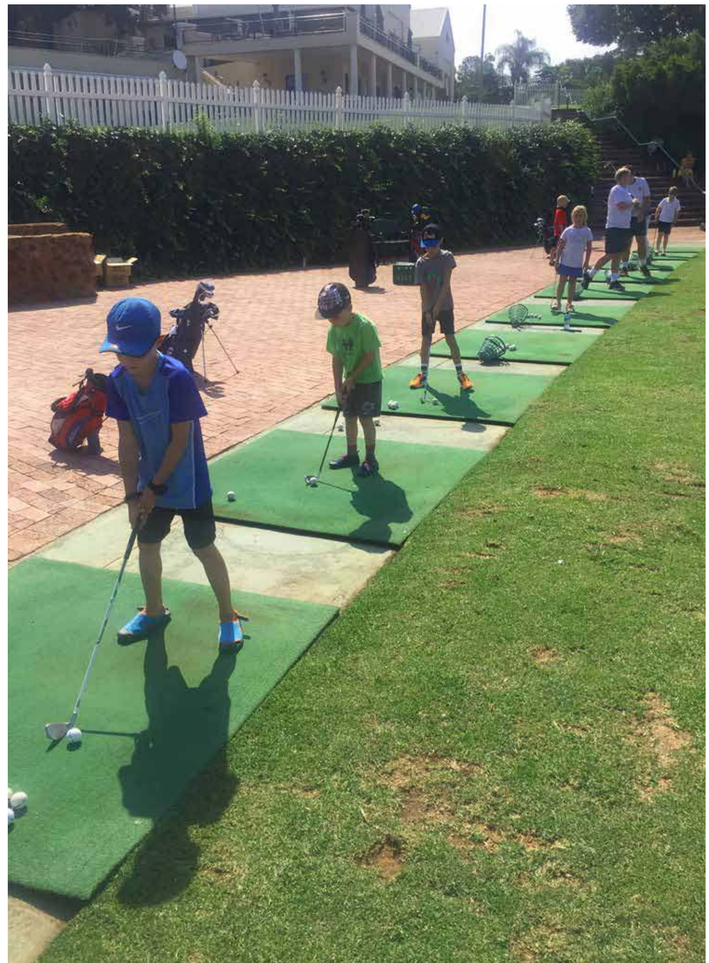
Juniors definitely not put off by the summer heat!