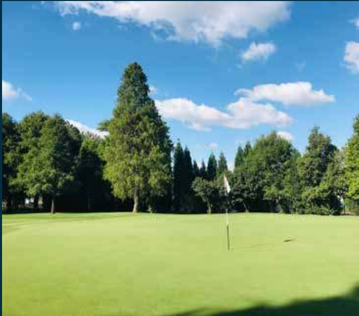
Hole 12 - after