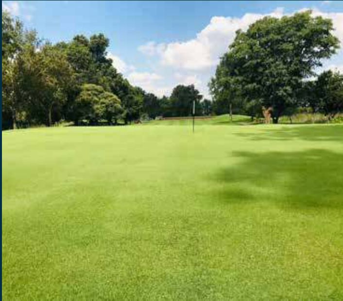
Hole 8 - after