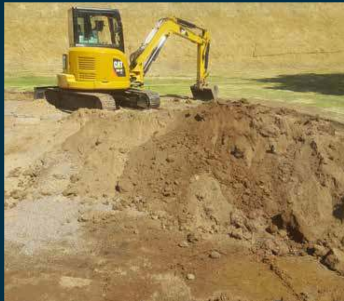
Hole 15 - before