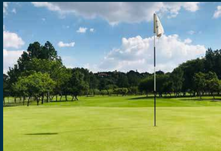
Hole 2 - after