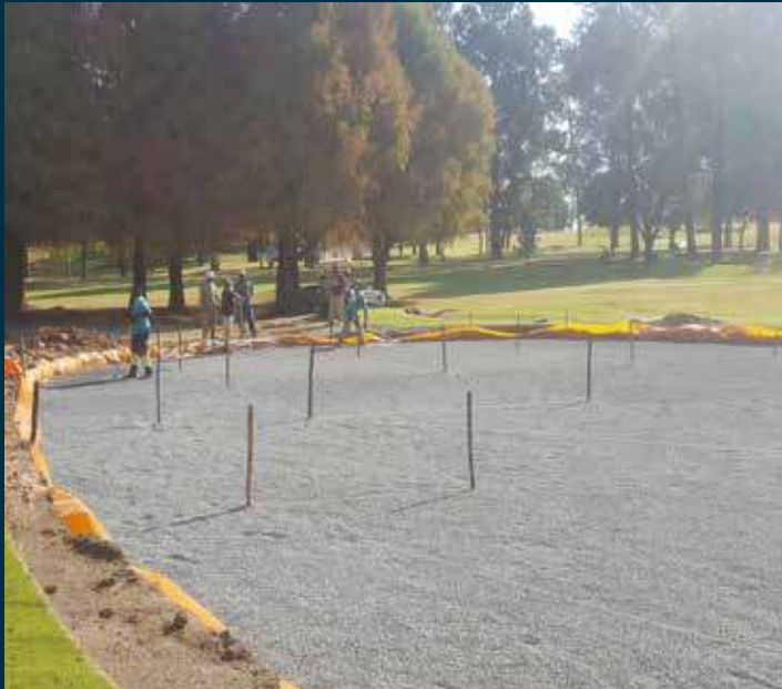
Hole 12 - before