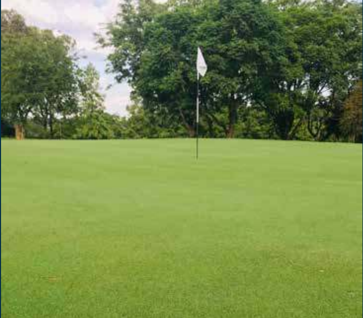
Hole 17 - after