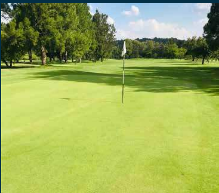
Hole 11 - after