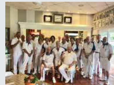
Biltong Trips. A very popular monthly competition where winners are awarded biltong and/or chickens.