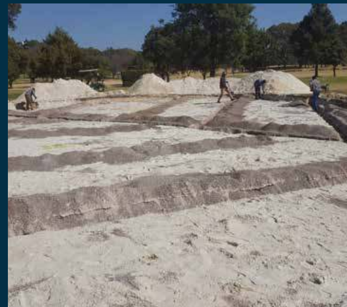
Hole 6 - before