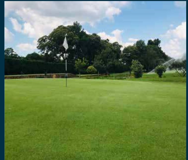
Hole 4 - after