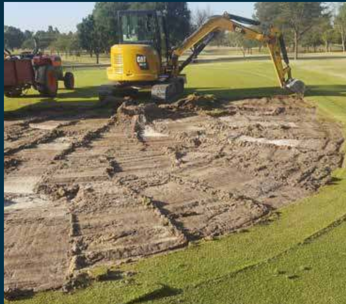
Hole 9 - before