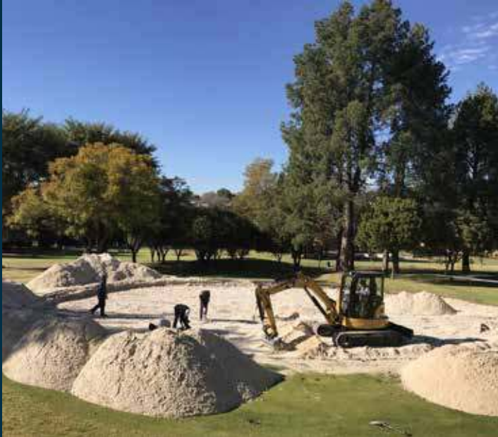
Hole 17 - before