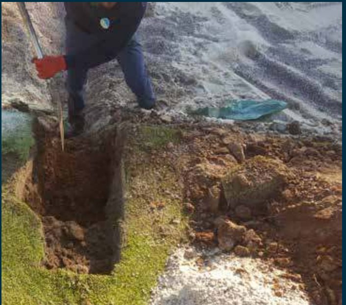
Hole 18 - before