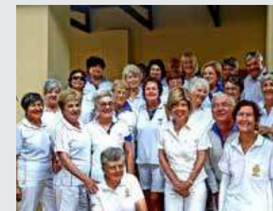
The Bowls ladies.