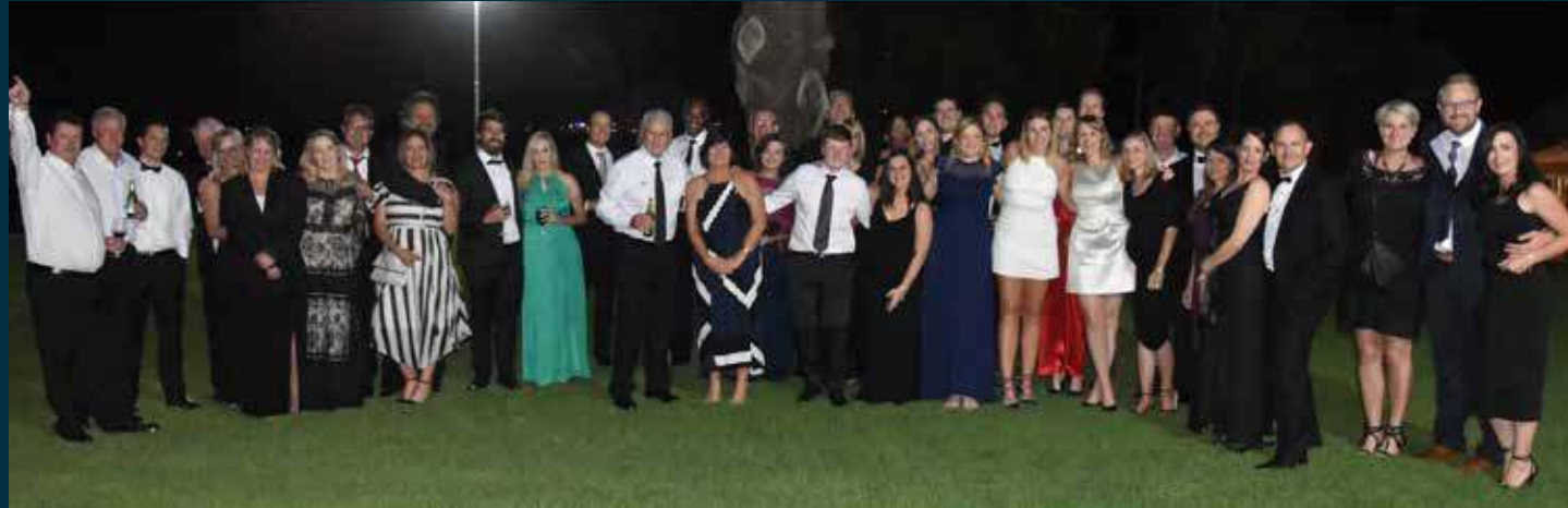
Group photo of the Squash Captain's Dinner.