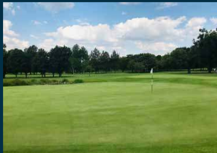
Hole 3 - after