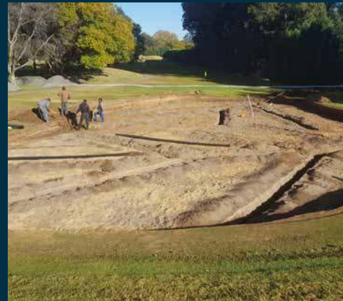
Hole 5 - before