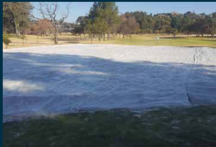
Hole 2 - before