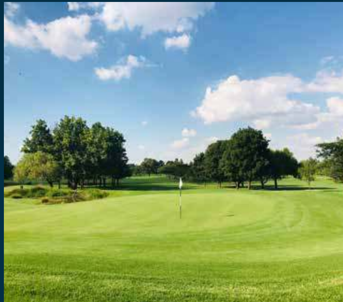
Hole 9 - after