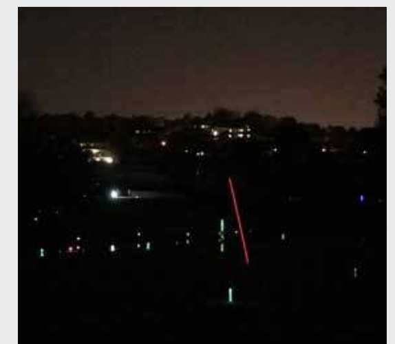
Nothing beats the Night Golf experience at PCC.