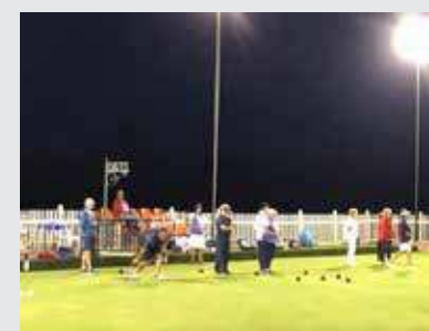
Inter-Club - Held over five months on summer evenings with CBCOB, PHSOB, Lynnwood and PCC participating.