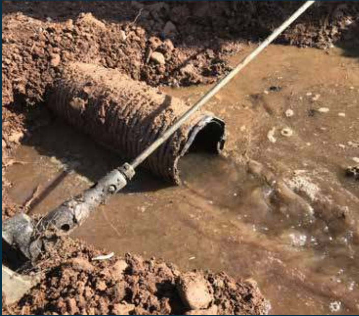
Hole 10 - before