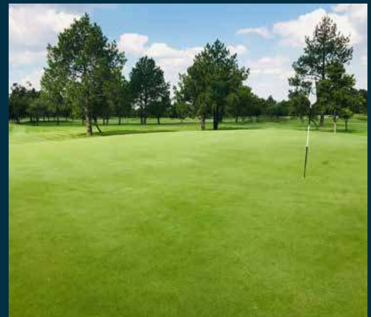
Hole 6 - after