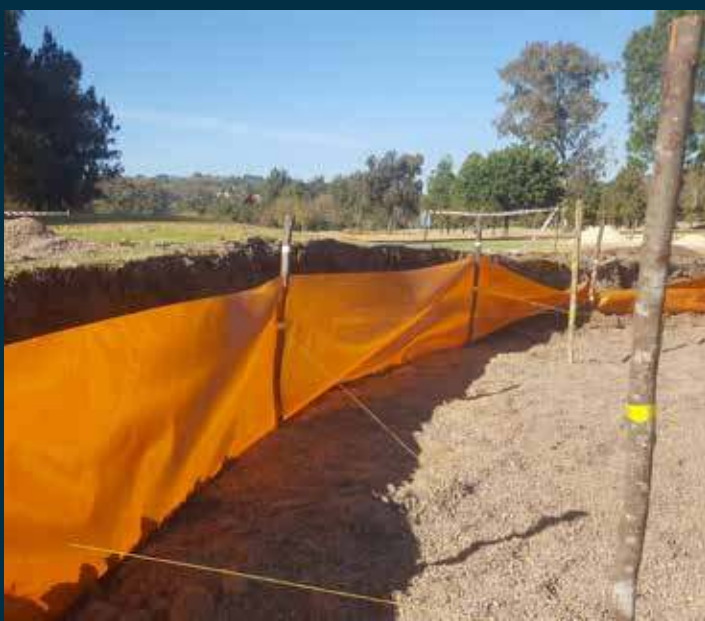
Hole 11 - before