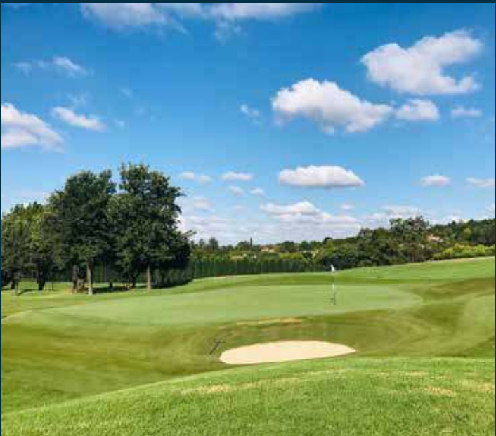
Hole 18 - after