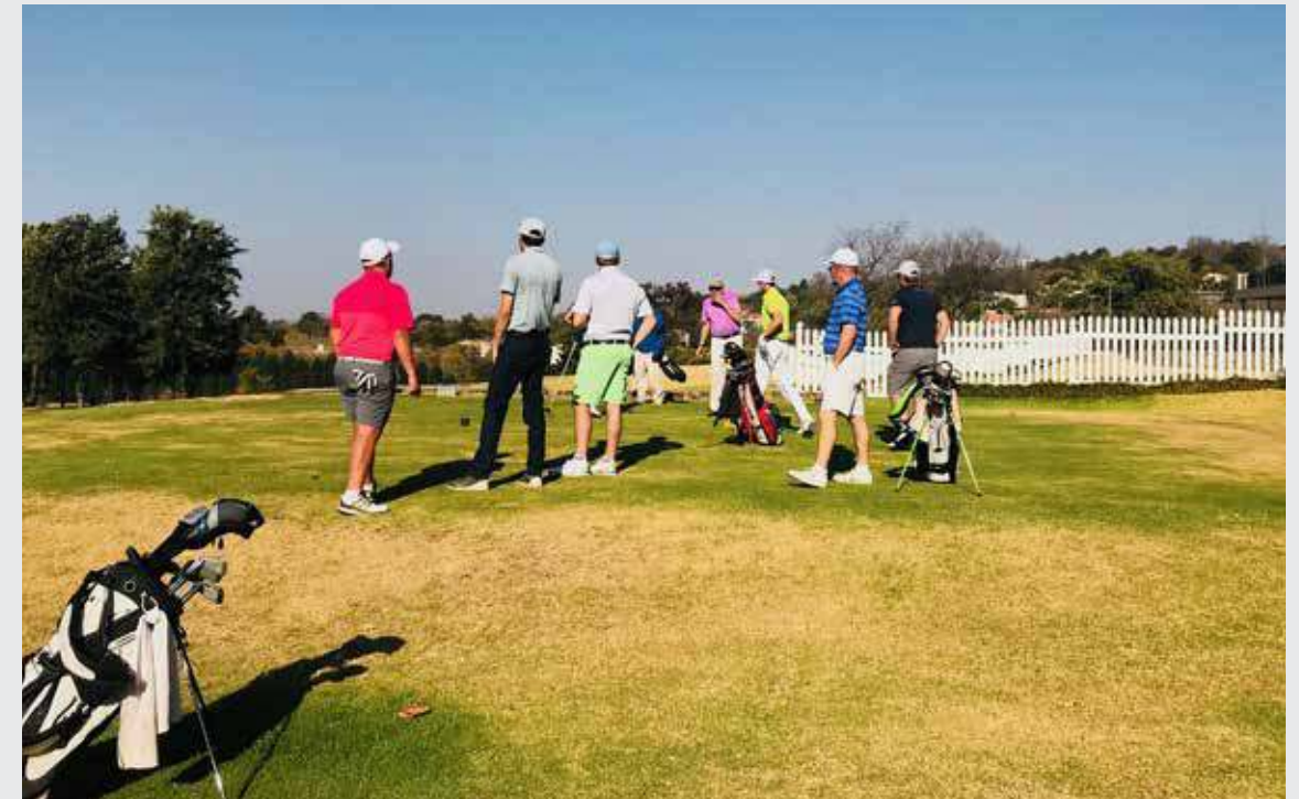
Golfers teeing off on the 10th hole in the KWV Foursomes Golf Challenge.