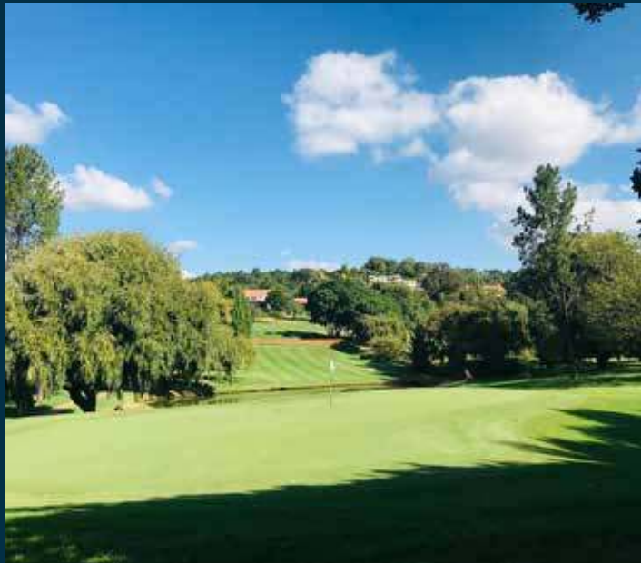
Hole 14 - after