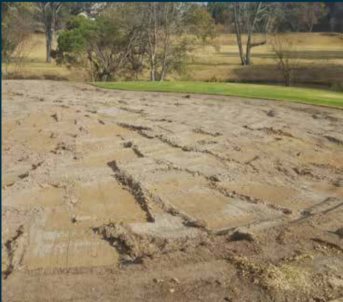
Hole 16 - before