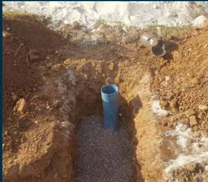
Hole 13 - before