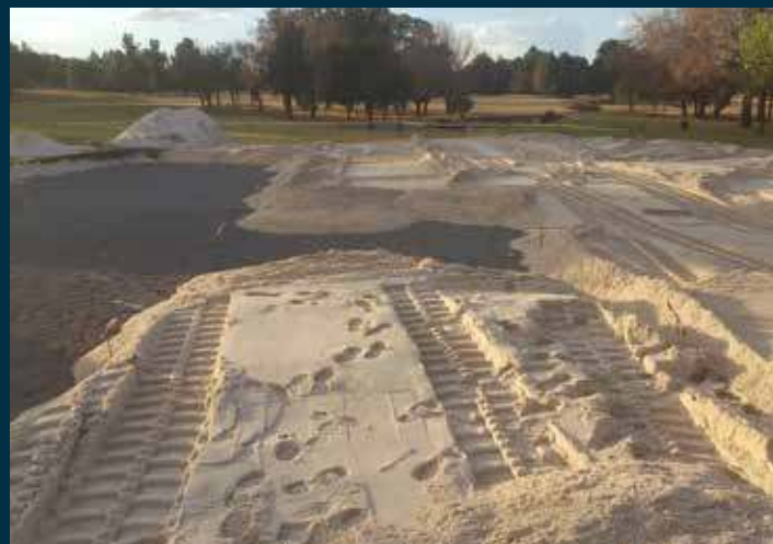
Hole 3 - before