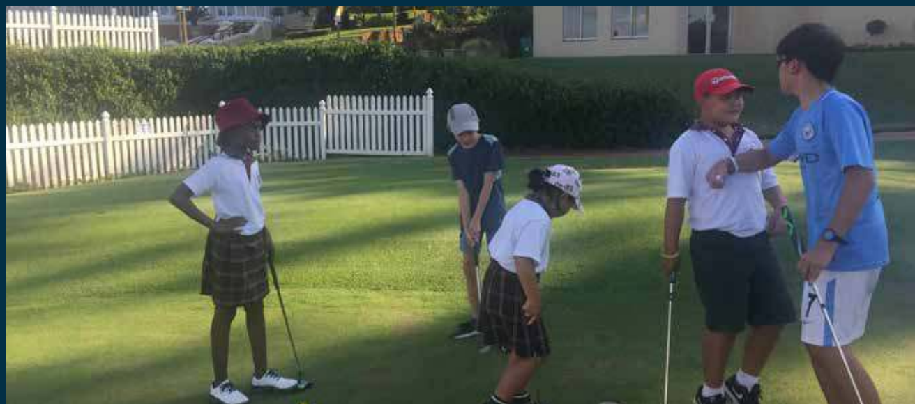
The kids are taught that you "drive for show and putt for dough".